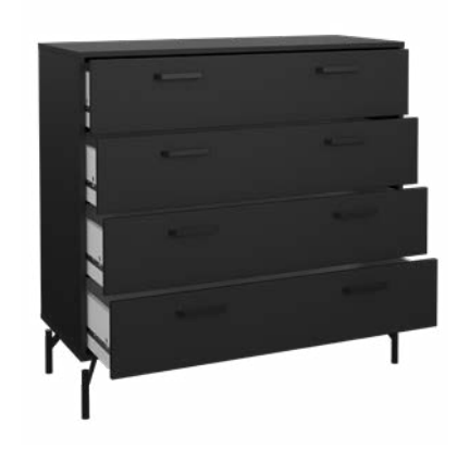
MATT BLACK 52304gmgm